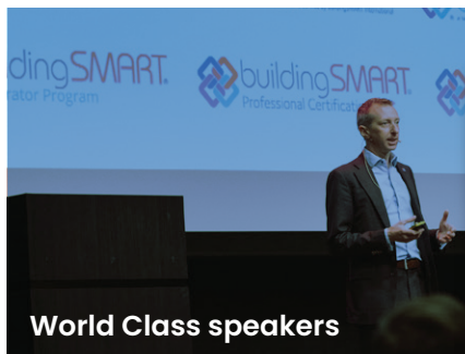
World Class speakers